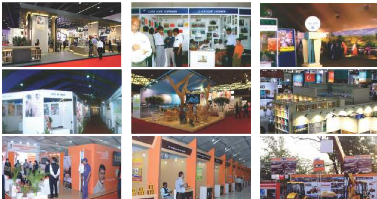
Few of Our Past Participants